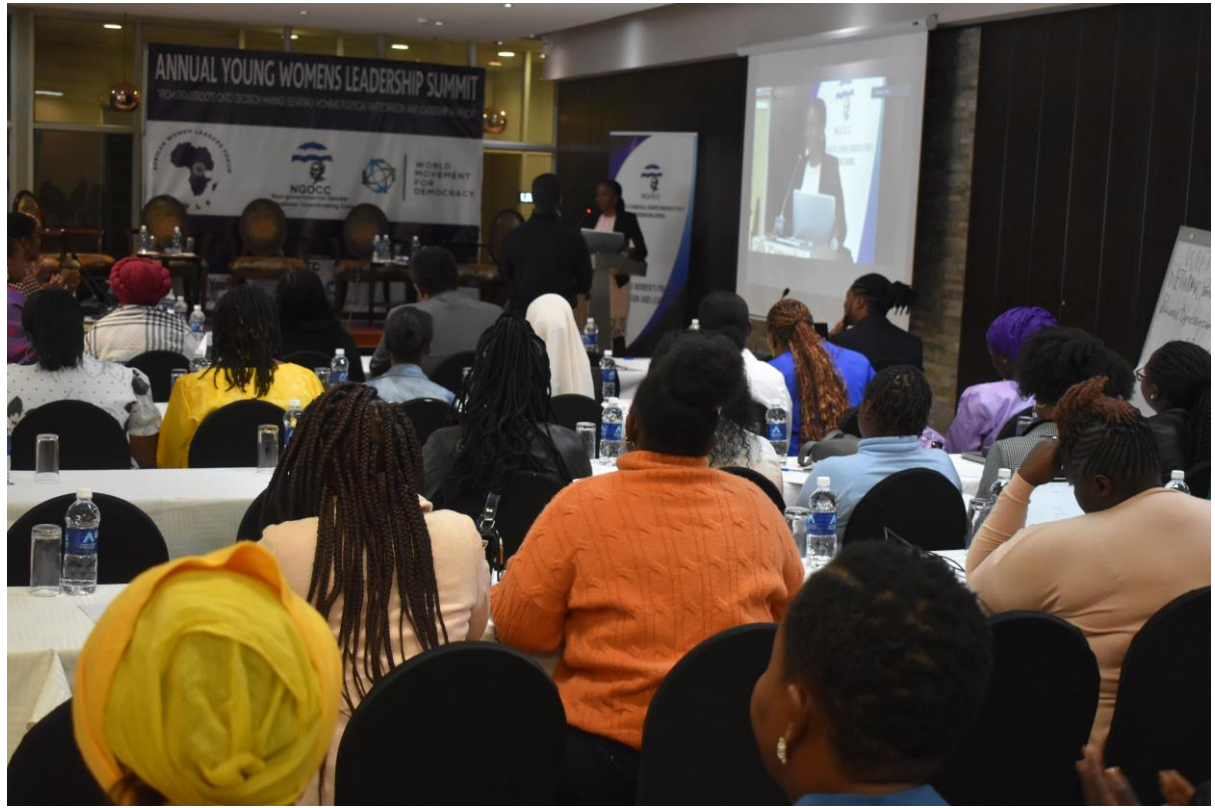
The 2023 Annual Annual Young Women Leadership Summit held in Lusaka, Zambia

Webinar on Addressing Violence Against Women in Politics: